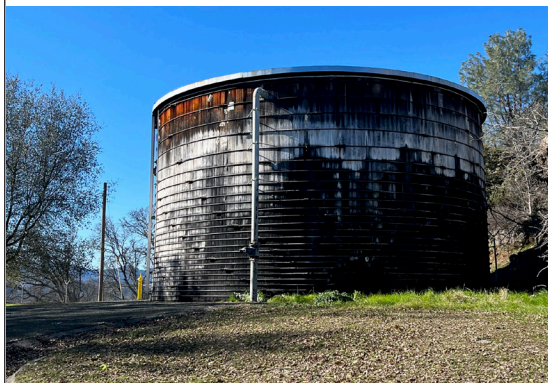
The 56+ year-old water tank in Unit 9 scheduled for replacement.

• Out with the old, in with the new! The District is making great progress with its Water System Storage Reliability and the Defensive Space and Ignition Resistance projects. We are thrilled to announce that we received 60% of the Engineering Design Packages for both projects, including maps of how the tanks will sit on-site. The Design Phase is critical because it serves as the instruction manual for the construction contractor. In just a few months, we will be ready to get our first shovel in the ground. It is all part of our continuing hard work to achieve our Mission of “protecting our community’s water!”